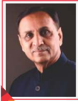
Shree Vijay Rupani Hon. Chief Minister, Gujarat State

Industrial exhibitions play a vital role of a bridge between the Industries, their buyers and the other stake holders. Similarly, the industrial exhibition titled “Gujtech Expo 2018” aims at bringing together Business Leaders, Corporate, Manufacturers, Entrepreneurs, and Buyers & Sellers with a focus to provide platform to exhibitors of various industrial segments from across the world to showcase their products and services.