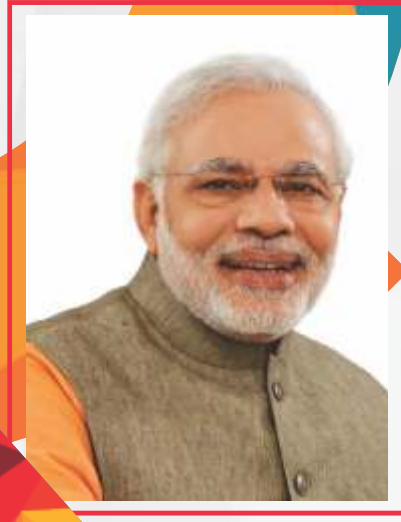
Shree Narendra Modi Hon. Prime Minister Of INDIA

“ To start a movement, you need a strategy that inspires, empowers and enables in equal measure. ”